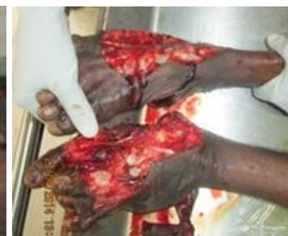
Figure 2: Crushed feet