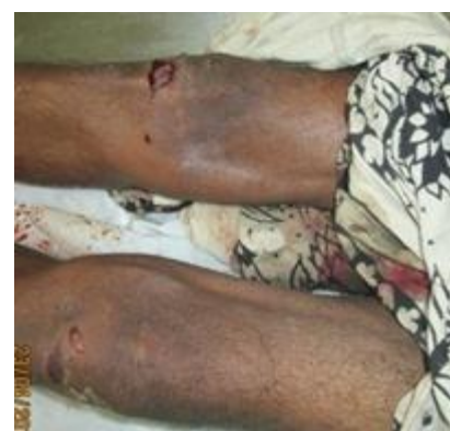
Figure 4: Superficial injuries on knees