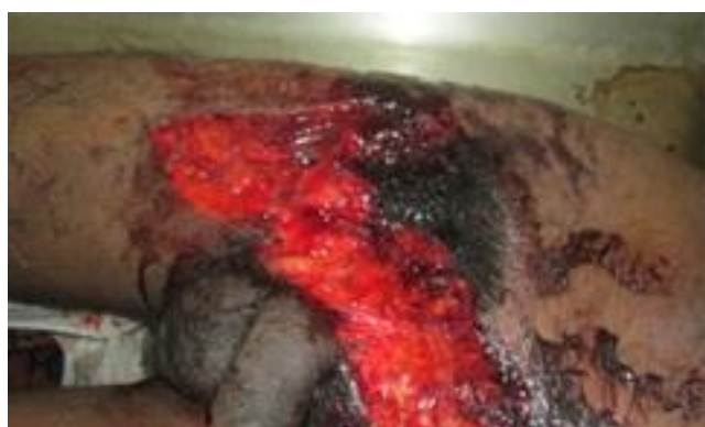
Figure 3: Crushed laceration over the pelvis