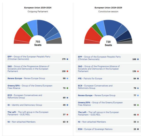
Fig 3: Comparative analysis of European Parliament seats in the considered period (2019-2024, 2024-2029)

The comparative analysis shows the following situation (see Fig 3):