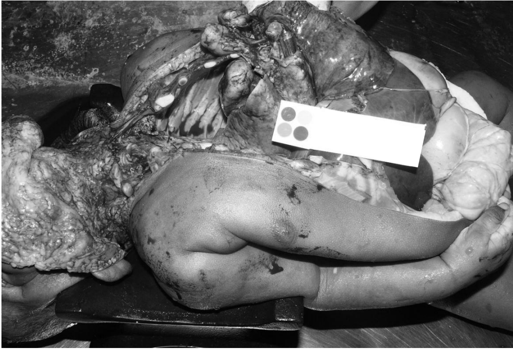
Fig 1: An oesophagus is cut open to show foreign bogy in mid third.