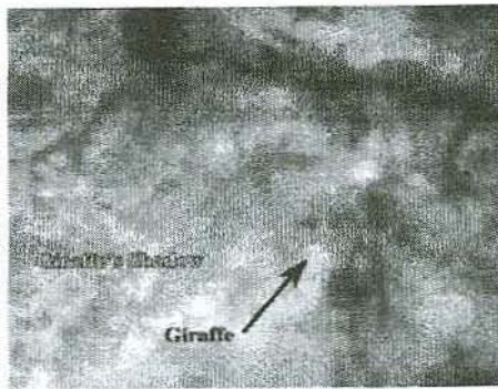
Figure 1: Spotting a giraffe by satellite

Finally, with the information attained by the tracking system a warning system is activated to inform the train drivers the possibility of an accident ahead and to manage the speed of the train accordingly.