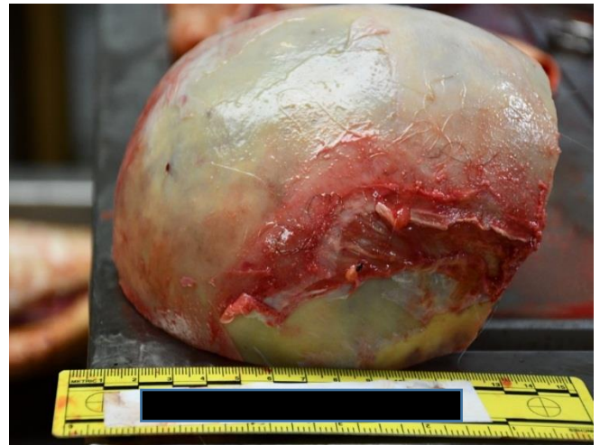
Figure 3: Skull cap. Absence of continuation hinge fracture.