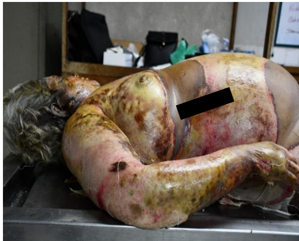
Figure 1: Extensive burns with yellow-greenish slough (severely infected)