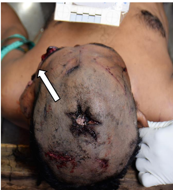
Fig: 6. stellate entry at the vertex [Exit in the same area as shown in fig. 5, Arrow-direction of the shot downwards and to the left]

A blood sample, strand of hair in the finger and the air dried cloth were sent to the Government Analyst (GA) for DNA analysis. Swabs from finger tips and webs, clipped nails from both hands and tissue swabs from two entry wounds were sent to explosive and fire investigation section of the GA department to detect gun powder residues. Hand writing of the deceased was taken from a log book and sent with a photograph of the scrawl on the floor to the Examination of Question Document section of the GA department. The cause of death was given as firearm injuries to the head and manner was concluded as homicide following the death investigation.