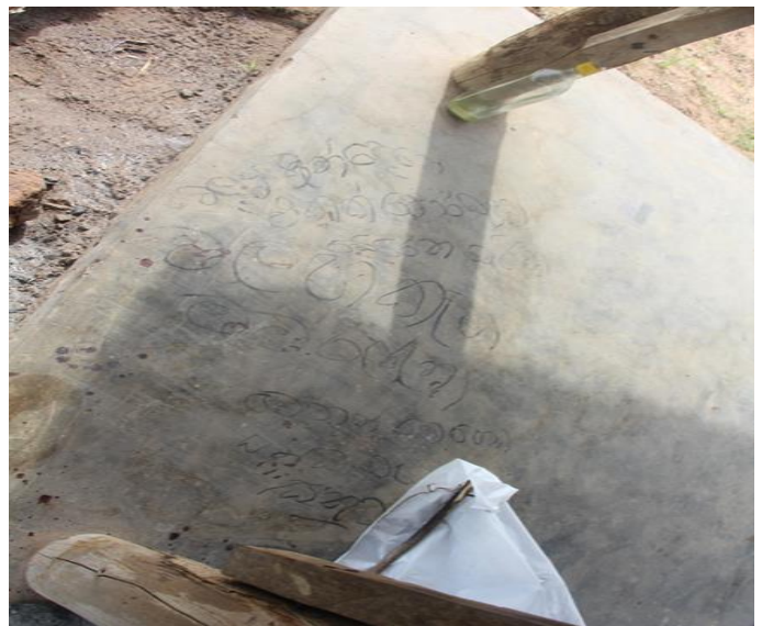
Fig: 2. Suicide note on the floor scribble by wood charcoal