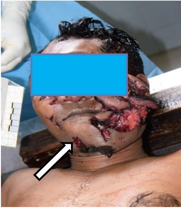
Fig: 5. Shot gun injury to the face. [Arrow-entry site and direction upwards and to the left]