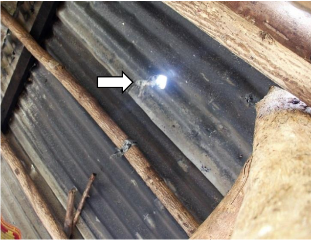
Fig: 3. Hole on the roof with a piece of cloth hanging (arrow).

CT scan was done prior to the autopsy. The pattern of metal pieces and pathway of pneumocephalus [Fig. 4] indicated that the direction of firing was from top of the head to the left side.