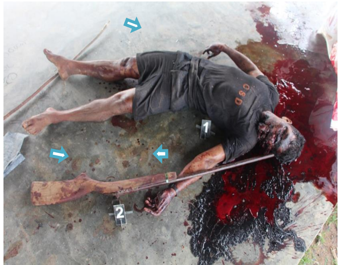
Fig: 1. Position of the dead body and the shotgun. [There were multiple human footprints either side of the body. (Arrows)]

One of the metal sheets of the roof had a circular hole with a small piece of cloth [Fig. 3]. This cloth was smeared with gun powder but had no blood. There were multiple fragments of human tissue in the surrounding area. A bag belonging to the victim was found in an area deep in the jungle about 6 km away from the chena, with blood and disturbed vegetation.