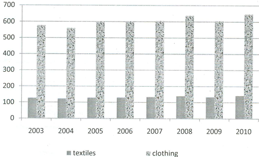
Figure 2 Domestic Value Addition in Textiles and Clothing Industry US $ million (2003-10)

Source: Authors' calculation based on Annual Report of the Central Bank of Sri Lanka, 2010.