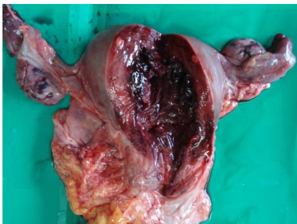
Figure 1: Blood clots in the uterus

Serious complications are resulted from illegal abortion causing morbidity and mortality. Reducing maternal mortality by preventing illegal abortion is a challenge. Mostly ethical, religious and political obligations prevent discussion on health values to prevent maternal deaths from illegal abortions. Therefore we need to initiate a discussion among medical and legal community to reduce the number of maternal deaths from illegal abortions.