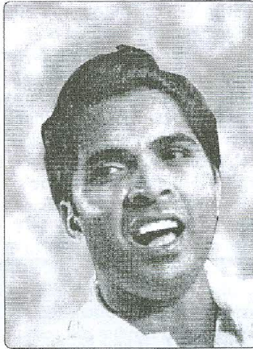
Figure 1.2: Portrait of the artist from his songbook Mal Mihira (1952)

mix of local (Sinhala language) and “cosmopolitan” (Western music and instruments) satisfy the paradoxical requirements of modernist reform.